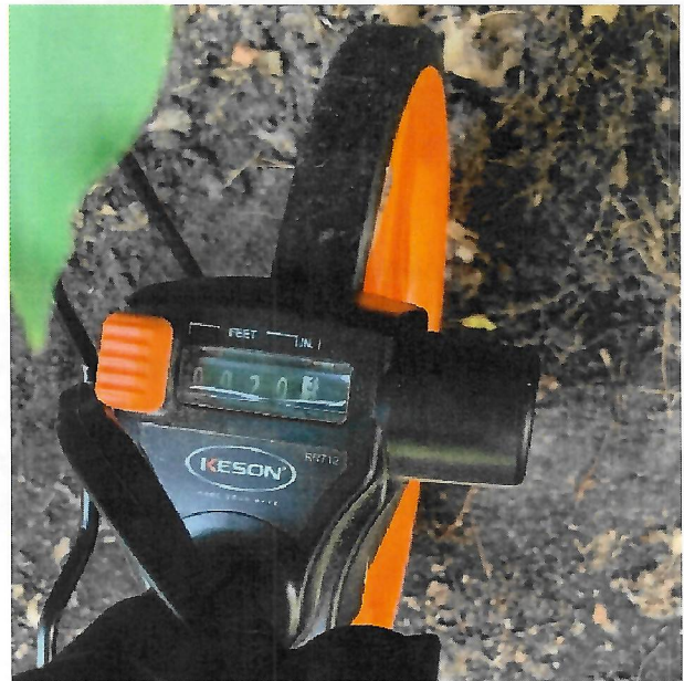
width 20'.3" I checked different spots on Lingan.