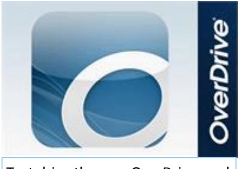
Test drive the new OverDrive app!

Full details coming soon! Books will be available October 3!