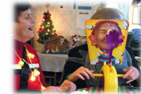
Girl Scouts stop by!