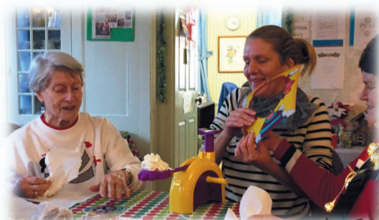
Silly Fun at the COA