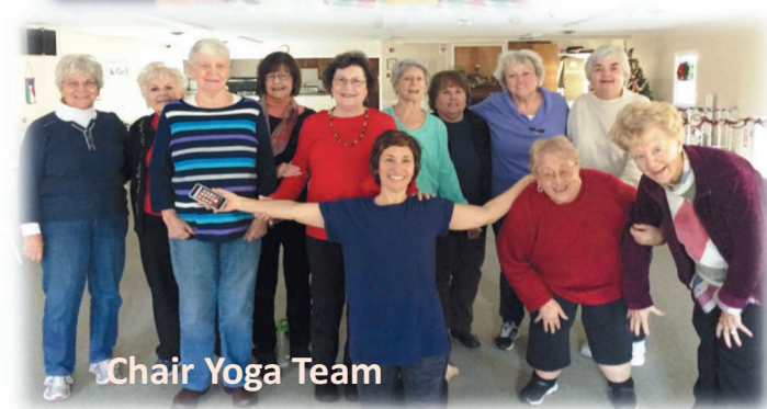
Chair Yoga Team

KEEP MOVING, EVEN THOUGH YOU'RE FEELING LIKE HIBERNATING.... The key to keeping well and flexible is key. This year, we're aiming for Olympic National Park outside of Seattle, and we need everybody to join us that can! Come by our office to see the 'sneaking across the USA' map and pick up your own record keeping booklet!